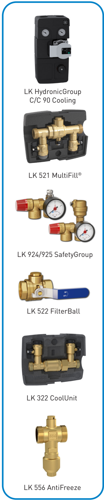
LK HydronicGroup C/C 90 Cooling