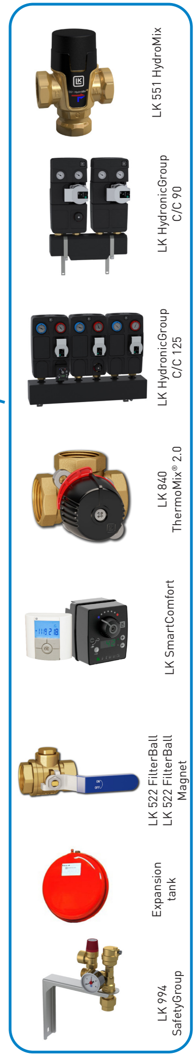
LK 551 HydroMix