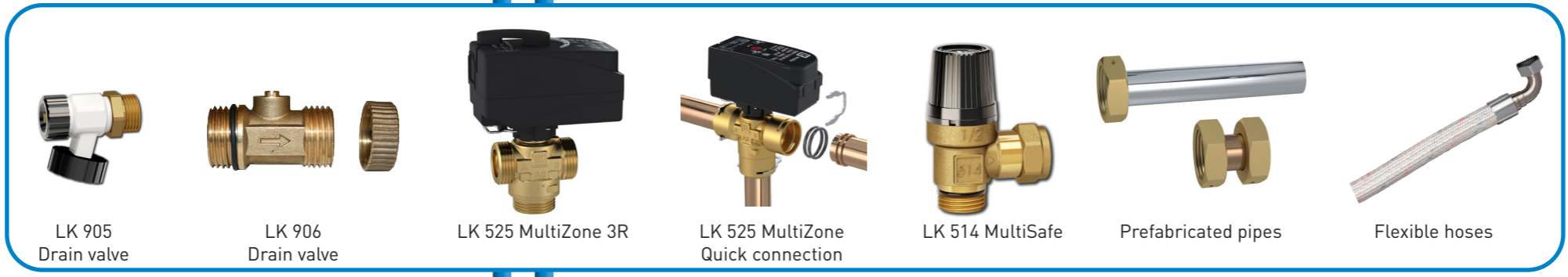
LK 905 Drain valve