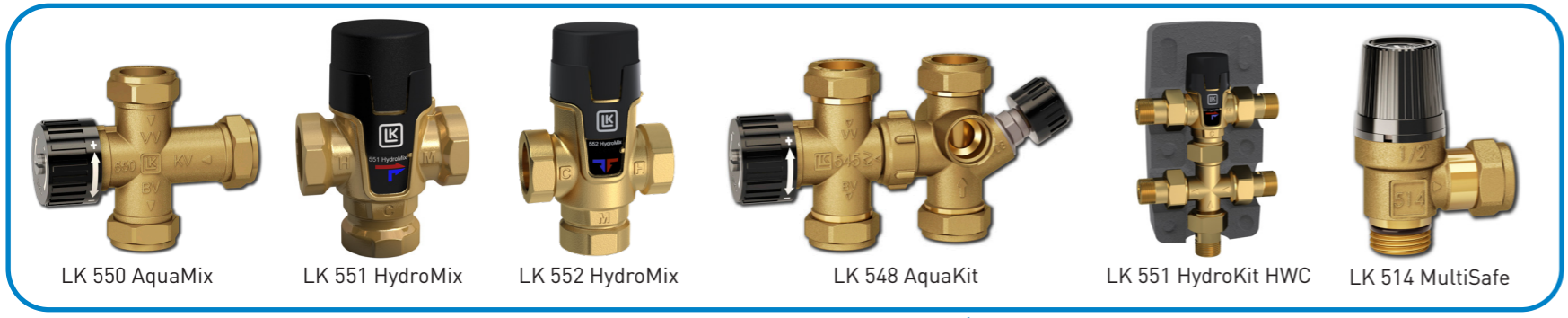
LK 550 AquaMix